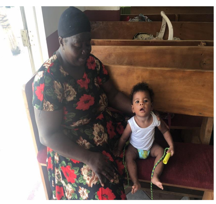
Hurricane Maria displacees in a shelter in Roseau.