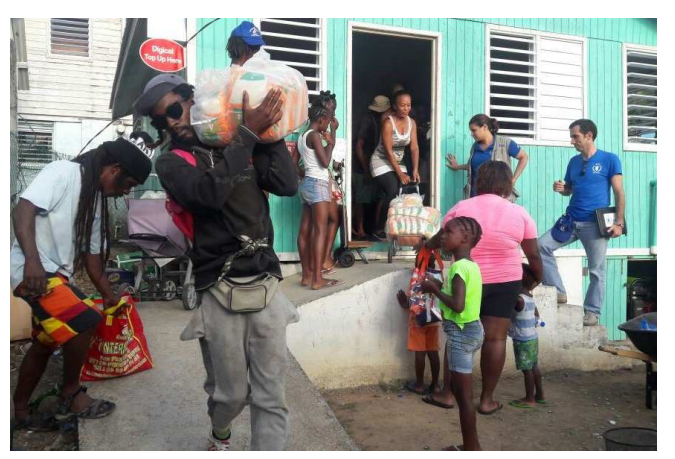
WFP food distribution in Coulibistri